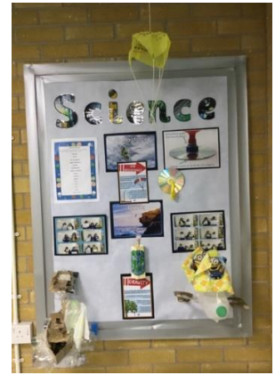
Upper Key Stage 2