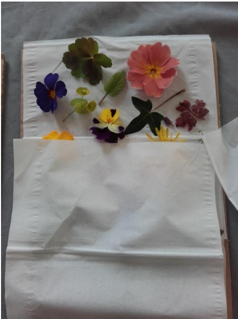
3. Put more tissue on top