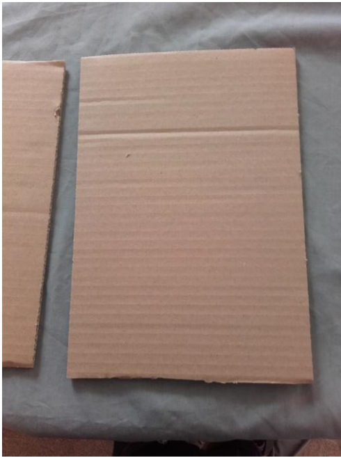
1. Lay cardboard on flat surface