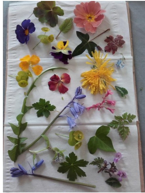
2. Place specimens on top of tissue or newspaper