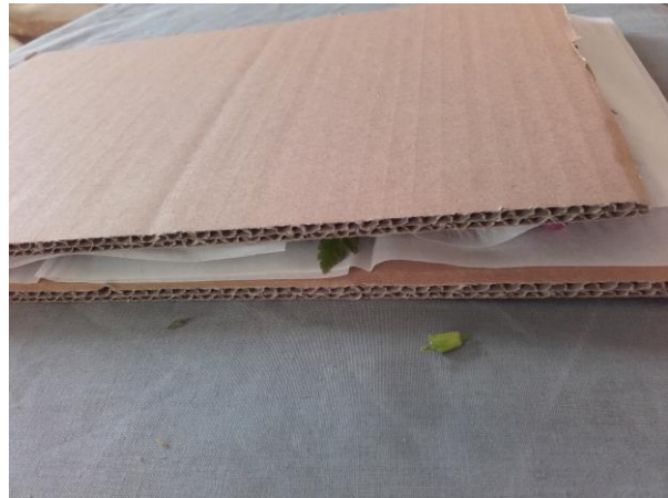
4. Form a sandwich by putting another layer of cardboard on top